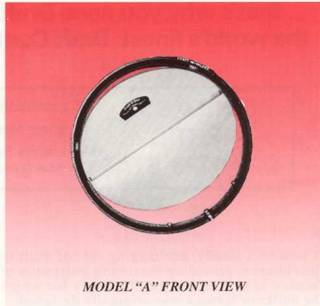
MODEL "A" FRONT VIEW