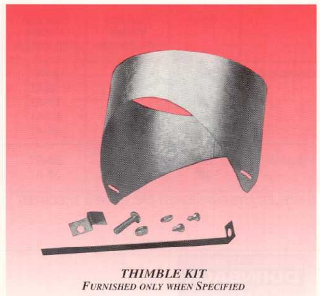
THIMBLE KIT FURNISHED ONLY WHEN SPECIFIED